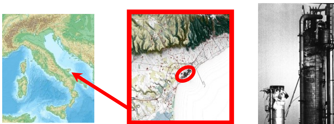
Figure 1. Area of study

Here, the extent of contaminated area was estimated in three steps.