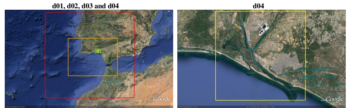
Figure 1. Modeling domains for simulations.

In Figure 1 modeling domains used in simulations are shown. The WRF model is built over a mother domain (called d01) with 9 km spatial resolution, with three nested domains: d02, with a spatial resolution of 3 km, d03, with 1 km of spatial resolution covering Huelva, and d04, with a spatial resolution of 0.333 km covering the Port of Huelva.