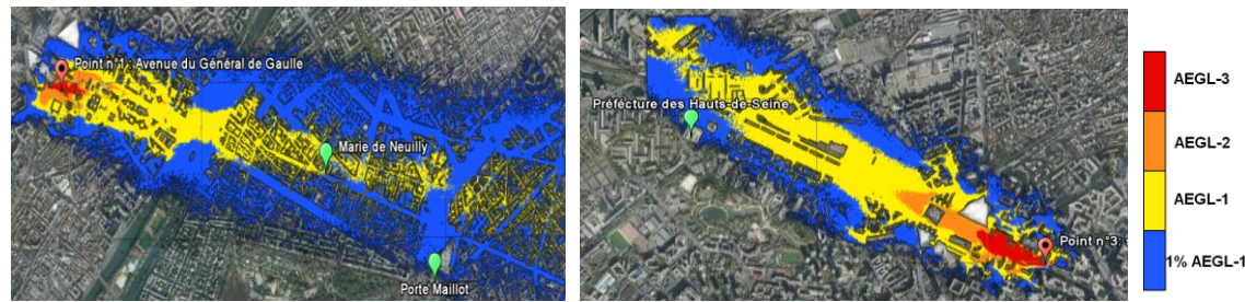
Figure 1. Distribution of a toxic chemical released in "La Defense" district (results given for two release locations). The danger zones have warm colours. They were determined using the AEGLs of the US-EPA.

Along with this, the CEA proposed several plausible CBRN-E events corresponding to either accidents or malevolent actions. In order to obtain a large panel of situations, different weather conditions, locations of the release, and toxic chemicals were presented as exemplified in Figure 1. For each possible place of the release, realistic scenarios and operating modes were built up (not reported in this paper).