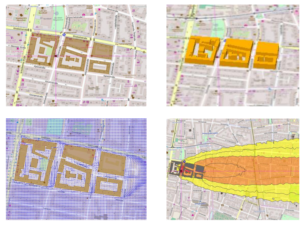
Figure 2. a, b, c, d. Scenario several building blocks. Figures show 2 d- and 3 d- sight (top left, top right), windfield (wind direction 270°) and inhalation dose for an arbitrary radionuclide and activity (bottom left, bottom right).

The following Figure 3 shows the inhalation dose inhalation dose [mSv] of an arbitrary radionuclide and activity in six different building scenarios compared to the flat scenario (without buildings). It can be seen, that the building effects reach a distance downwind of minimum 200 m from the source. From these scenarios it can be assumed, that for a realistic urban scenario the downwind distance will significantly exceed the distance as shown here.