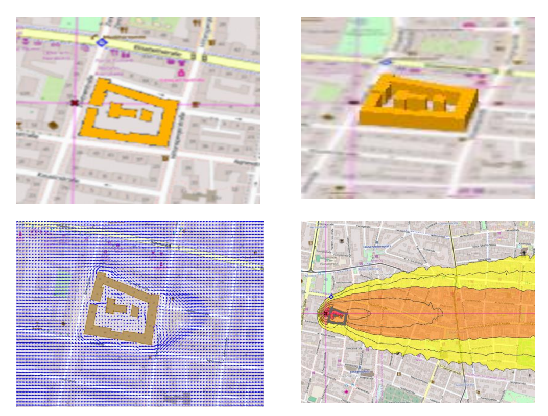
Figure 1. a, b, c, d. Scenario building block. Figures show 2 d- and 3 d- sight (top left, top right), windfield (wind direction 270°) and inhalation dose for an arbitrary radionuclide and activity (bottom left, bottom right).

Some results for wind fields (Lprwnd) and exposition from LASAIR are depicted in the following figures: