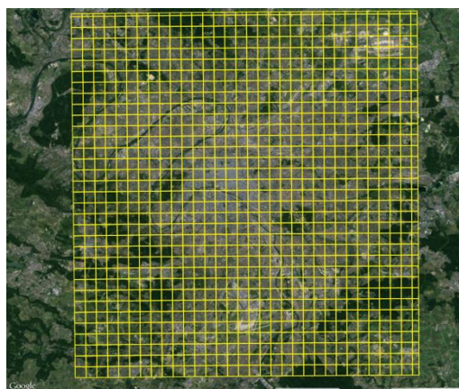
Figure 1. View of the 1088 computing tiles over the 40 by 40km domain

Meteorology and turbulence are computed starting from WRF meso-scale forecasts operated routinely at CEA over France. The domain is 40 by 40km and meshed at a resolution of 3m, consisting of roughly 12 500 x 13 300 nodes. Vertically, it extends up to 1000m using 39 grid points. The domain contains more than 6 billion nodes. It is divided in 1088 tiles, computed in parallel. Each tile has a size of 401 x 401 x 39 nodes.