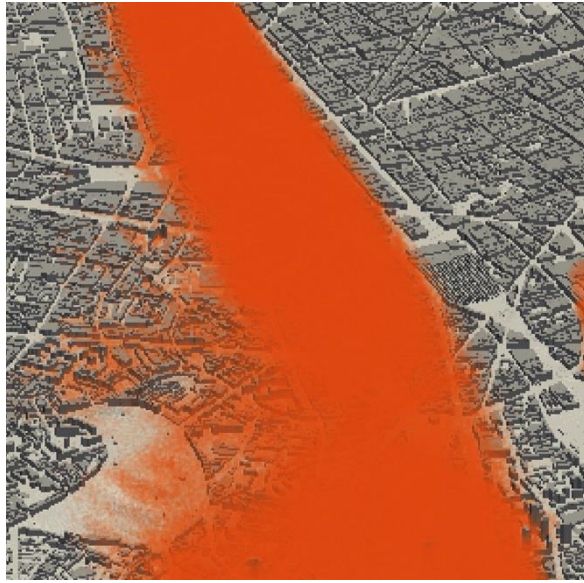
Figure 4. Close-up 3D view of the plume remaining trapped by topography and buildings near the Buttes Chaumont park on the left side of the picture

Tests have been realised using from 1 000 (the minimum) up to 25 000 cores.