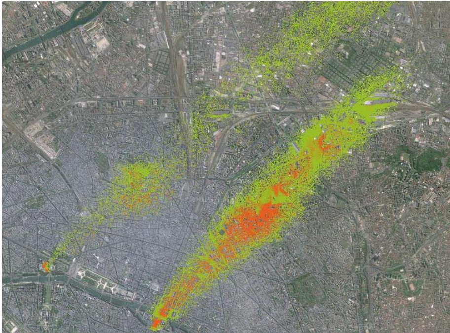
Figure 5. Web geographical information system view of the plumes 1h50mn after the first release