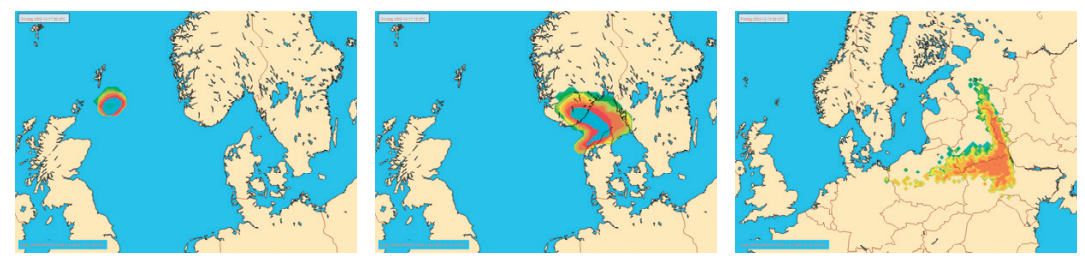
Figure 1. Total activity at the ground: 6 hrs (left), 18 hrs (middle) and 60 hrs (right) after explosion.