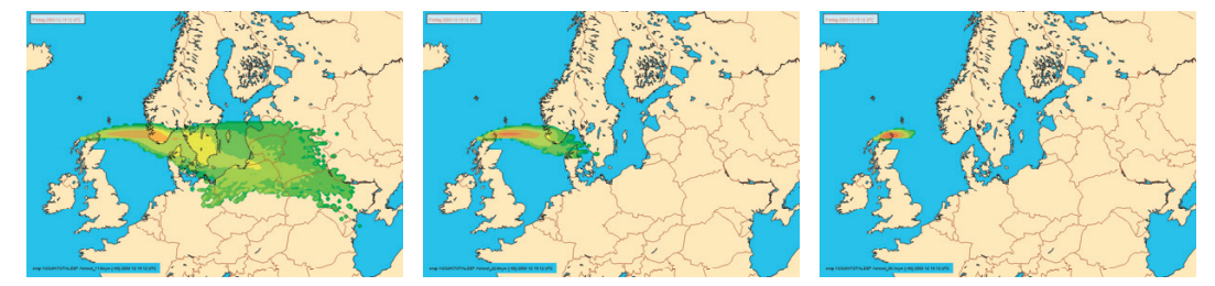
Figure 2. Accumulated total deposition for class 4 (left), 5 (middle) and 6 (right) of the particle radius, 60 hours after explosion.