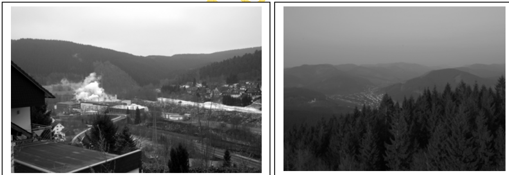
Figure 1. Examples of terrain, where the German TA-Luft procedure cannot be used.

This regulation does not apply only in a few locations with extraordinary steep terrain, but already in numerous cases in low mountain ranges with altitude difference lower than 200 m or 300 m (Figure 1).