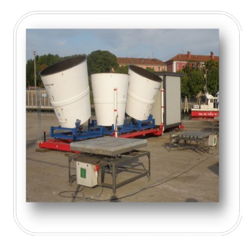
Figure 28. Rass/Sodar station with the Sonic Anemometer.

The mobile RASS- Airone provided by ISMES-CESI was installed on board a 13 m semi-trailer carrying a container containing acquisition electronics, Doppler radar and an acoustic generator.Remote measurement takes place when the acoustic generator emits a brief impulse upward and the corresponding radio echo captured by the Doppler radio receiver antenna is analyzed. The SODAR LP-120 was provided by ISMES-CESI and is composed by three individual antennas aimed in specific directions to steer the acoustic beam. The Sonic Anemometer METEK-USA 1, provided by ISMES-CESIusesultrasonic sound wavesto measure wind velocity. They measure wind speed based on the time of flight of sonic pulses between 3 pairs oftransducers. The instrumentation is connected with a data capture system Meteoflux®, that allow to collect real time data of the three wind component and of the eddy covariance requested for the calculation of turbulence parameter and of radiation fluxes. The anemometer was coupled with a meteorological station to measure local temperature, pressure, humidity and precipitation. Severalsensors have been located to collect radiation and heat flux data. The instrumentation is showed in Figure 28.