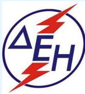
Public Power Corporation of Greece