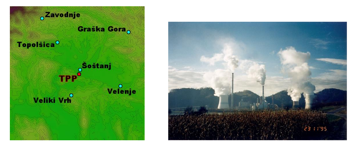
Figure 1. Šoštanj TPP in centre of domain in size of 15 km x 15 km surrounded by 6 automatic environmental measuring stations (left) and location of the plant near the hills (right)

Most of Slovenia has very complex terrain. This includes the region of north-east, where the ŠTPP is located. The micro-location of the ŠTPP is at the edge of the Velenje Basin, which is surrounded by hills. Figure 1 shows the terrain in an area of 15 \text{km} \times 15 \text{km} centred around the ŠTPP. The wider surrounding area has similar characteristics. To the north and north-west, towards the border with Austria, lie the Karawanks, which are part of the Alps and constitute an even more prominent vertical barrier than the highlands immediately surrounding the basin. There are only a few narrow valleys between individual hills with rivers flowing along them, the most notable of which in the direct vicinity of the power plant is the River Paka, which winds its way south of the power plant through the hills.