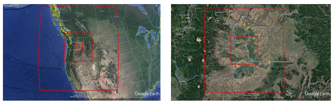
Figure 1 . Modelling domains for simulations d01, d02, d03 and d04 (left), and d03 and d04 and measurement stations considered for the numerical evaluation (right). [Images generated using Google Earth]

In Figure 1, modelling domains used for the simulations over the Hanford Site are shown. Modelling is built over a mother domain (called d01) with 27 km spatial resolution, centred at 46.55°N 119.5°W; inner nested domains (d02, d03 and d04) have 9-3-1 km as horizontal resolution.