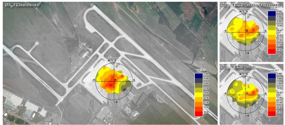
Figure 3. Pollution roses for measurement (left), EDMS + background (up, right) and EDMS (down, right) results of daily average NO<sub>x</sub> concentration, at T2 site in 2012

In case of PM_{10} , whereas correlation coefficient show good agreement, a significant underestimation is demonstrated from statistical indicators, however apron area and passenger parking emission shows similar magnitude of emission in EDMS results, which corresponds to the reality. Although background values are determined with assumable uncertainty, the magnitude of PM_{10} concentrations is certainly underestimated by EDMS.