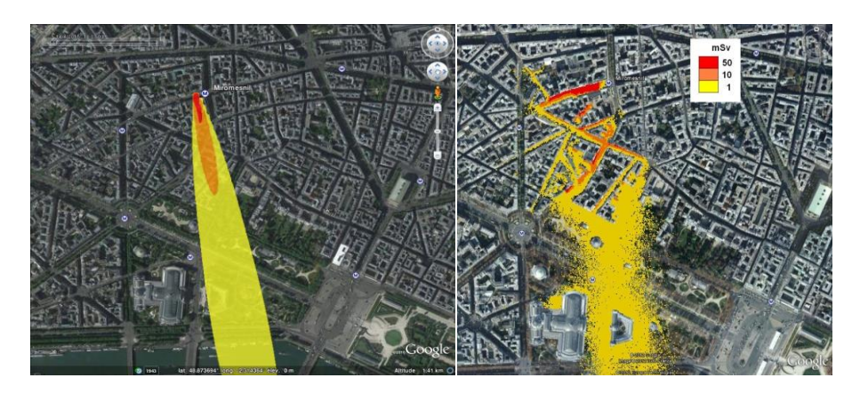
Figures 1-a) and 1-b). Total effective dose due to the fictitious release of 10 TBq of <sup>60</sup>Co in Paris city center(emergency response exercise).Prediction by a Gaussian model (a) and by diagnostic flow and LPDM models (b).S is the source location.

exposure. This example and many others provide evidence for why first responders and decision makers should use up-to-date flow and dispersion modelling, whether they undertake it themselves or receive it from scientific advisers.