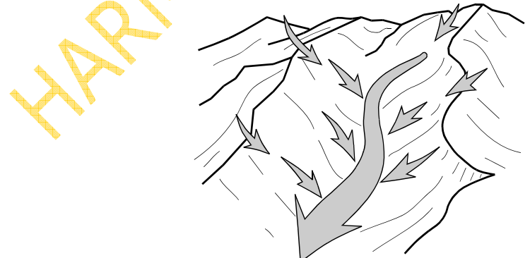
Fig. 2; Idealised representation of an airshed dominated by nocturnal cold air drainage.

An idealised airshed is essentially a region within which an air pollution problem is largely 'contained' because of the combined effect of the topography and local meteorological conditions. That is, any emissions emitted within the boundary of that region tend to contribute to the air quality of only that region, and the air pollution experienced is emitted only by sources within that region. There is therefore no point going outside the region to solve the air pollution problem, and any amelioration strategies must apply to emissions that originate inside it. In reality, there will generally be some downstream leakage of pollution in and out of airsheds, out to sea in the case of most of New Zealand's coastal cities, such as Christchurch or Auckland, and into inland mountain basins due to plain-to-basin airflow ( Kurita, H. et al. , 1990). In more densely populated or industrialised countries, leakage of pollutants can obviously take place from one airshed to another. Technically, an airshed may vary in size from a few square kilometres in a valley or small basin (Figure 2) to a large flat uniform area covering hundreds of square kilometres. However, the time frame for air pollution transport and dispersion is such that there is generally an upper limit to the size of area involved.