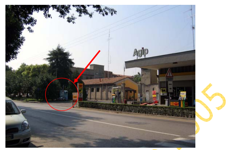
Figure 2; Wrong location of a PM10 monitoring station

limit. The second station is correctly located and monitored in the same year an annual value of 28 \mu g/m<sup>3</sup> and 34 exceedances.