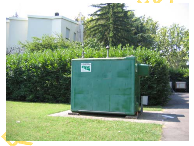
Figure 3; Right location of a PM10 monitoring station

In order to evaluate the effectiveness of air quality planning measures, a methodology of data assessment is proposed, based on an average approach extended on wide areas, such as regional zones and agglomerations.