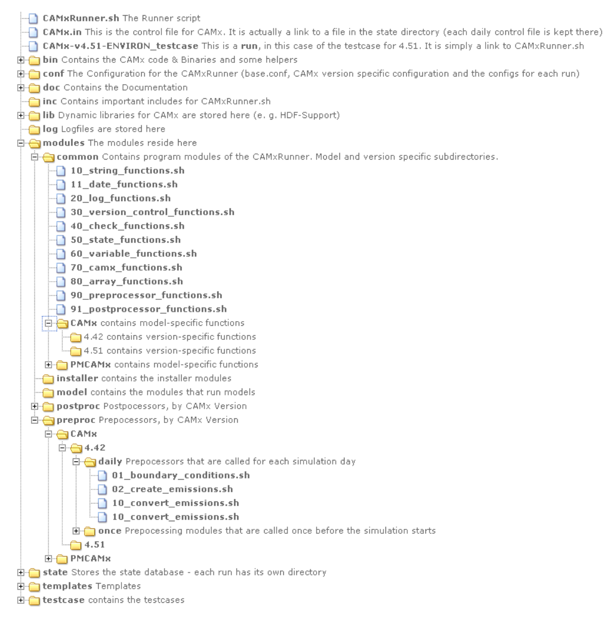
Figure 1: The directory structure of CAMxRunner

In Figure above, you can see that the subdirectory combination CAMx/4.42, 4.51 and 5.10 occurs in many different places to separate modules (these are bash-wrappers to call the binaries) and other components of the system.