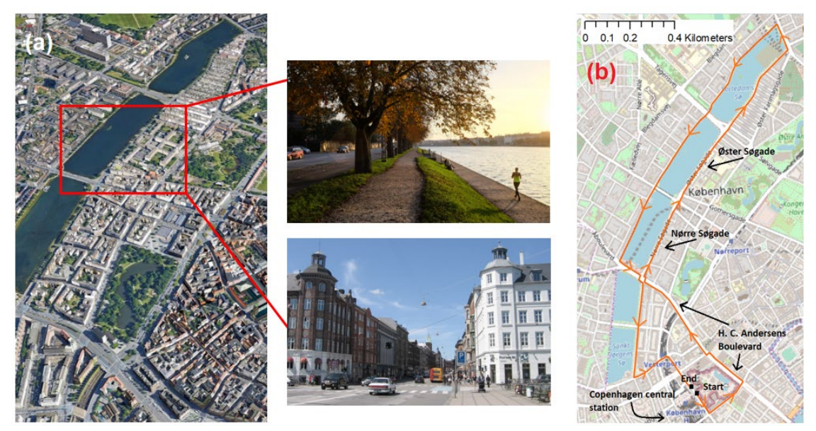
Figure 1: (a) The Copenhagen lakes and their surroundings (b) Experiment 1: A walking activity from Copenhagen central station to the lakes and back (4 February 2019).

whole activity, the location was tracked via an app, OSMTracker for Android and air pollution was modelled. The air pollution (NO<sub>2</sub>, PM<sub>10</sub>, PM<sub>2.5</sub>) was modelled using the AirGIS exposure modelling system (see Figure 2). The detailed system operation is provided in Khan et al. (2019a) and will not be repeated here. In short, the system works at three different spatial levels of pollution, regional, background and street-level, and can estimate pollution levels at any location of interest.